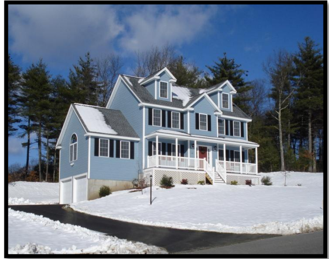
Pictures used in this document include options that are available at an additional cost. Please consult your broker for a list of options and prices.